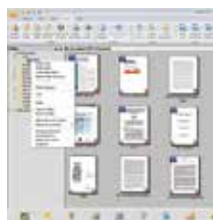
The PaperPort SE14 main screen

- The Professional Choice to Organize and Share Your Documents